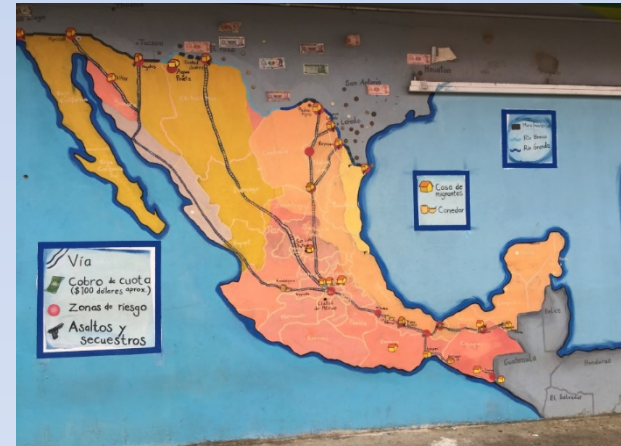
Mural, La 72 migrant shelter, Tenosique, Mexico, LAWG July 2016