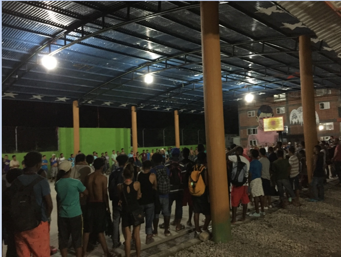
La 72 Migrant Shelter, Tenosique, Mexico- LAWG, July 2016