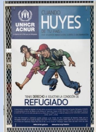
UNHCR posters Tenosique, Mx- LAWG July 2016

Siglo XXI, Detention Center, Tapachula, LAWG July 2016