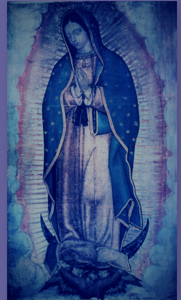
NY Latin Culture Magazine

Reflection - Yes, God will bring them back to us as the prophet Baruch reminds us in this second week of Advent. But some seem resistant to human cries for protection. Building on the traumatic separation of families at the border, some in the administration are trying to block immigrant families from having a permanent, secure future in the United States and scare them away from seeking access to health care, nutrition, and housing programs. Our lives in this country should be defined by how we contribute to our communities, not by how much money we have. The new "public charge," or better "wealth test," regulation puts the wealthy ahead of people who have waited years for a green card. This proposed policy could not be further away from the message of Our Lady of Guadalupe, whose feast we celebrate this week on Dec. 12th. Placed in the heart of Advent, this celebration reminds us that the lowly, the poor, the ones who count for nothing in human eyes--very much like Juan Diego, the poor peasant to whom Mary chose to appear-- are the people she favors. God does not look at our wealth to declare us worthy to belong to the kingdom. Yet our immigration policies would like to look into the pockets of immigrants, before welcoming them into the United States of America. Like John the Baptist we need to go in our streets and proclaim again even louder this time: "Prepare the way of the Lord, make straight his paths...and all flesh shall see the salvation of God."