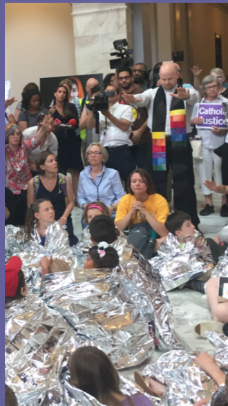
Faith leaders and children act and pray in Russell Senate Rotunda against family separation and detention.

Prayer - Loving Lord of Life, we pray for immigrant families in this moment who are detained, hungry, lonely, confused, and seeking hope. May you grant to them a vision of life beyond barriers, that they might truly experience a home again that offers safety beyond threats, hope beyond harm, and love beyond locked gates. And give any of us privileged to live freely the courage and will to do all we can to offer healing and end family detention. AMEN.