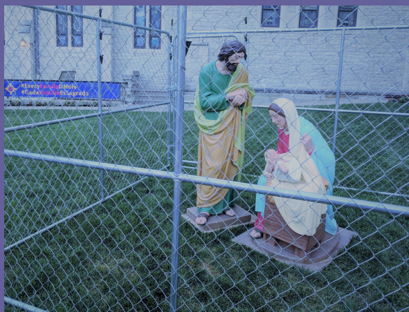
Christ Church Cathedral

We invite you to consider placing your tabletop nativity set inside a cage, surrounding it with wire, or making a large outdoor display with fencing to remember immigrant or refugee families now enduring detention and displacement. Be inspired by the display of Christ Church Cathedral, Indianapolis - installed since family separation began last summer! Images related to each devotion's theme are also provided on pages 20 and 21. Print these out on large mailing labels or other sticky paper to affix to your display in the first four weeks. Then place the images near your nativity on and following Christmas Eve, to help recall the daily challenges faced by migrants seeking hope. On Christmas Eve, be sure to remove any barrier around your nativity to celebrate the power of Christ's birth to overcome oppression.