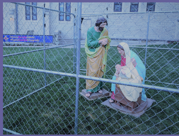
<u> Christ Church Cathedral</u>

We invite you to consider placing your tabletop nativity set inside a cage, surrounding it with wire, or making a large outdoor display with fencing to remember immigrant or refugee families now enduring detention and displacement. Be inspired by the display of Christ Church Cathedral, Indianapolis - installed since family separation began last summer! Images related to each devotion's theme are also provided on pages 20 and 21. Print these out on large mailing labels or other sticky paper to affix to your display in the first four weeks. Then place the images near your nativity on and following Christmas Eve, to help recall the daily challenges faced by migrants seeking hope. On Christmas Eve, be sure to remove any barrier around your nativity to celebrate the power of Christ's birth to overcome oppression.