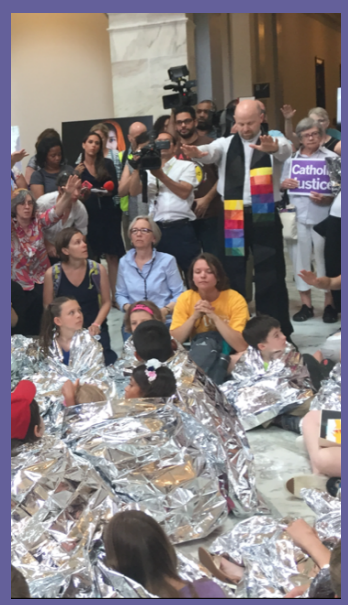
Faith leaders and children act and pray in Russell Senate Rotunda against family separation and detention.

Prayer - Loving Lord of Life, we pray for immigrant families in this moment who are detained, hungry, lonely, confused, and seeking hope. May you grant to them a vision of life beyond barriers, that they might truly experience a home again that offers safety beyond threats, hope beyond harm, and love beyond locked gates. And give any of us privileged to live freely the courage and will to do all we can to offer healing and end family detention. AMEN.